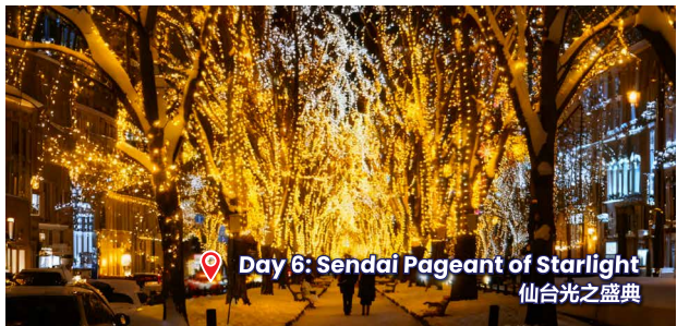
Day 6: Sendai Pageant of Starlight 仙台光之盛典