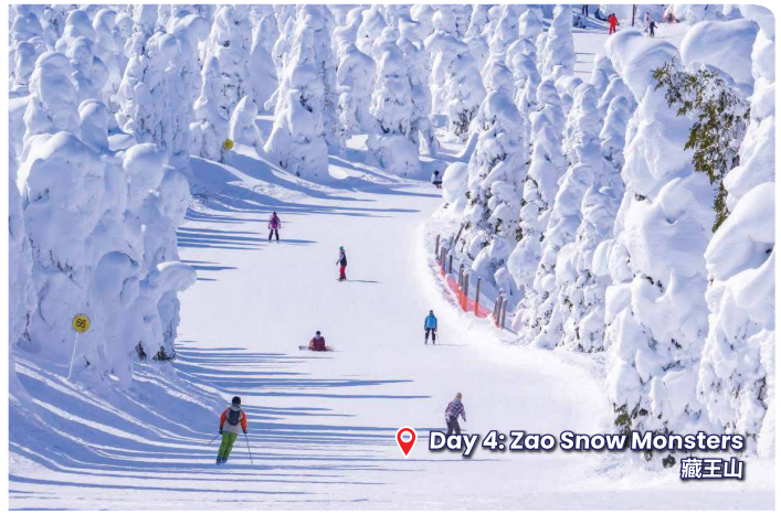
Day 4: Zao Snow Monsters 藏王山