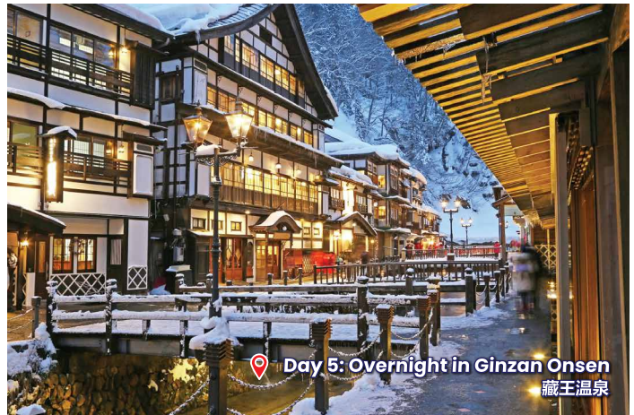
Day 5: Overnight in Ginzan Onsen 藏王温泉