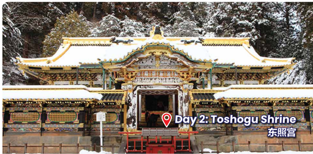
Day 2: Toshogu Shrine 东照宫