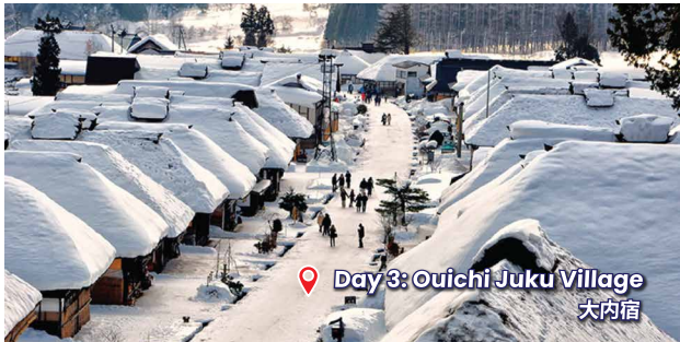
Day 3: Ouchi Juku Village 大内宿